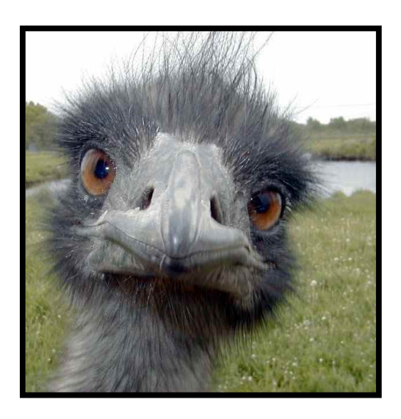
What's an Emu?